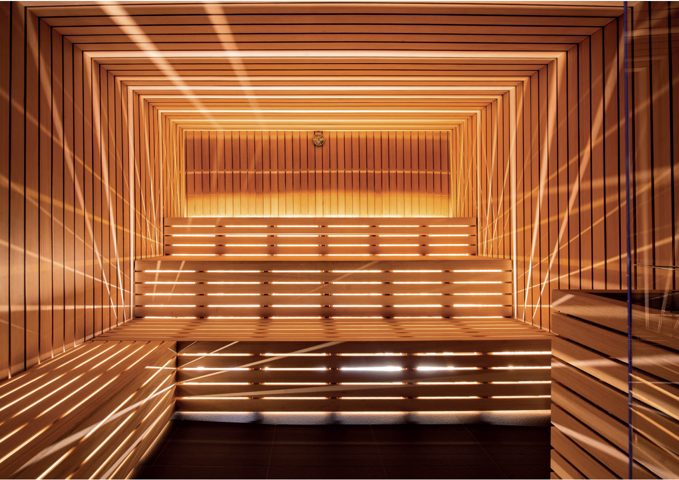
Product FINNISH SAUNA ELEGANCE is certified, and certified versions are available upon request.

Soft, integrated lighting, a panoramic front wall of windows, and a striking glass panel behind the sauna's stove, create a perfect fusion of Finnish tradition and Italian design.