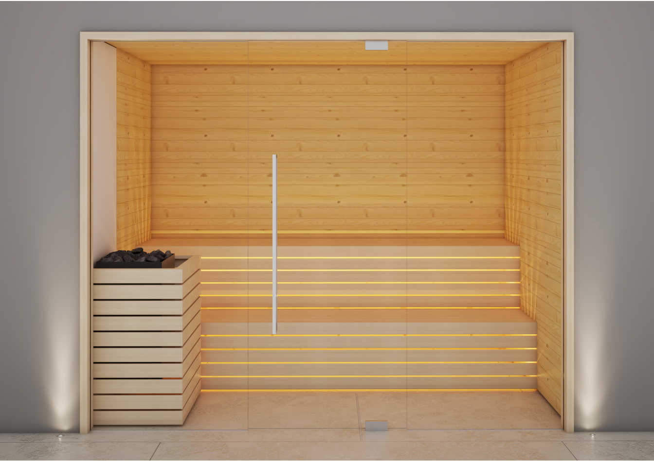
Product FINNISH SAUNA EVOLUTION is certified. and certified versions are available upon request.

Essential in terms of lines and enriched by lights and fragrances. Elegance is the classic dry sauna typical of the Finnish tradition, whose temperatures vary between 90° and 100°C.