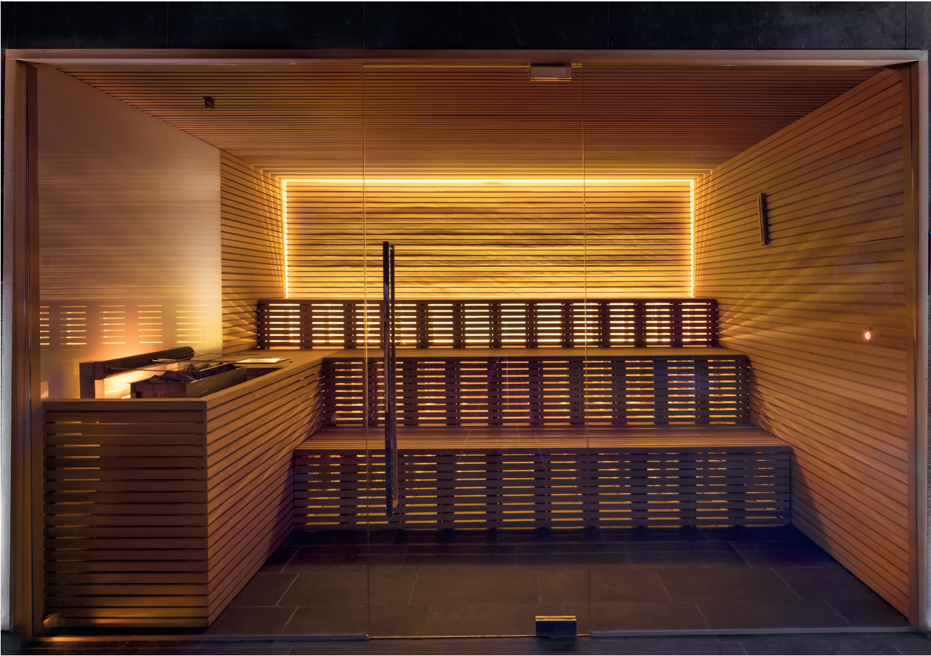
Product FINNISH SAUNA ONSEN is certified, and certified versions are available upon request.

The Finnish sauna is a way to discover the ancient rituals. Onsen, from the Japanese word referring to a spa is a relaxing and familiar sauna.