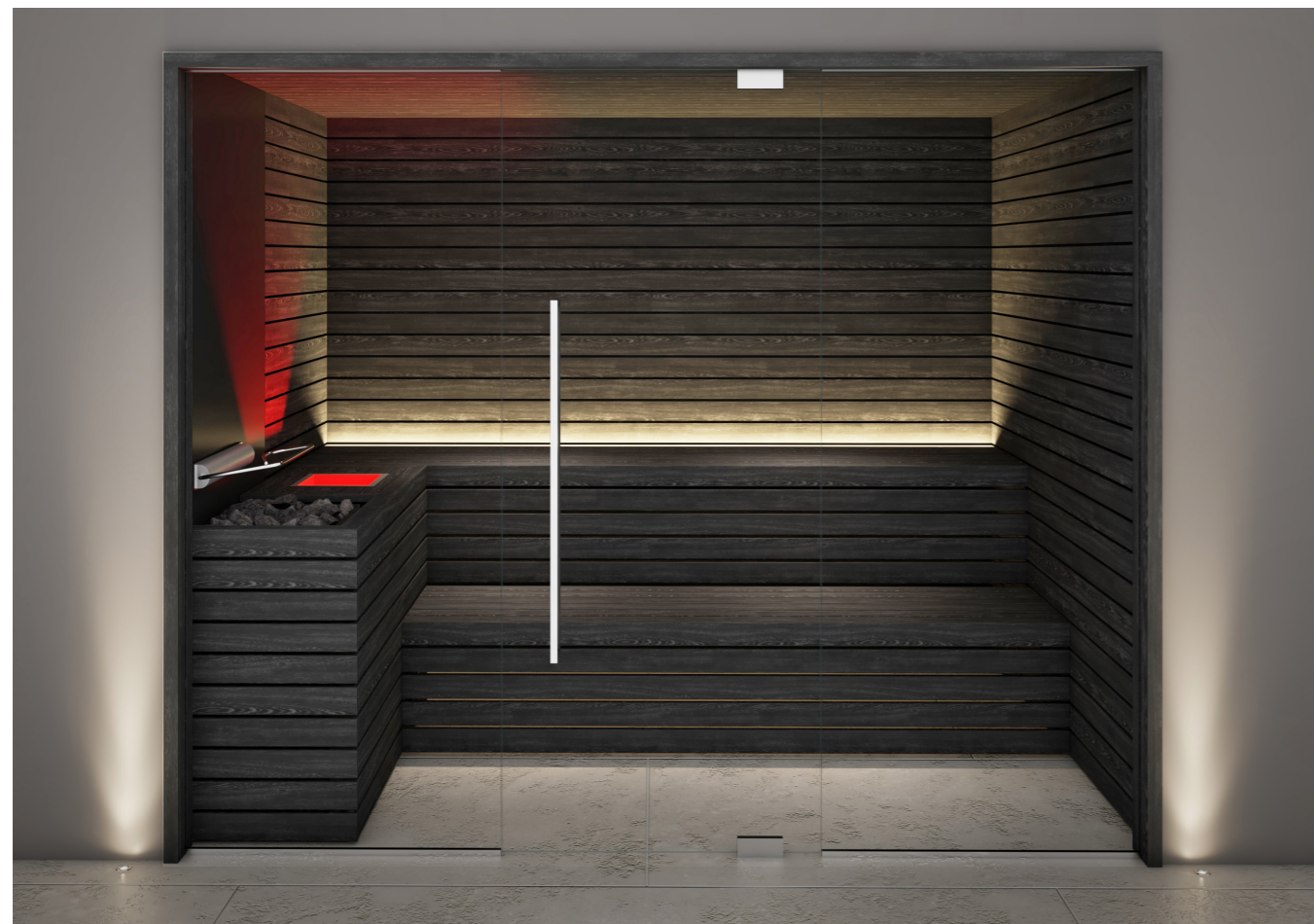
Product FINNISH SAUNA VELVET is CE certified, UL and SR certified versions are available upon request.

Velvet Sauna, a new, sensual Myrtha Wellness creation, is brought to life through coloured features that combine the latest technology with the essence of design. Our new sauna experience is at once, soothing, calming, and unforgettable.